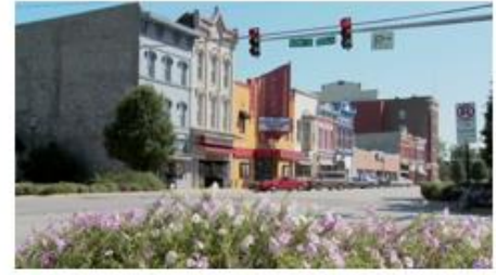
Downtown Ottawa, Kansas